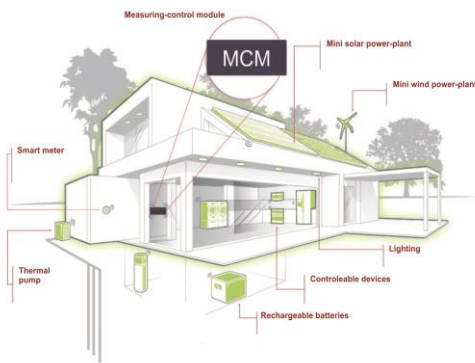
Figure 2. One of possible solutions for using of MCM systems

The aforementioned new product should allow the preparation work of the power system to meet the requirements of the Law on the quality of electricity, whose adoption was announced in the near future.